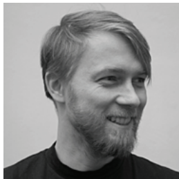
Design: Martin Pärn & Janne Nõu, Iseasi

Creative Corners brings co-creation space into the office. There's a time and a place for every kind of work. Including creating and working in teams. We need dynamic and flexible space where furniture doesn't hamper us, but instead empowers our collective creativity – without us even being aware of it – to think up something new, to develop and test our ideas, to play with our plans. Innovative environments that support working together ask for different type of settings and furniture than we're used to seeing in an office. The Creative Corners range brings new ideas and new kinds of behaviour into your office, and gets them working for you.