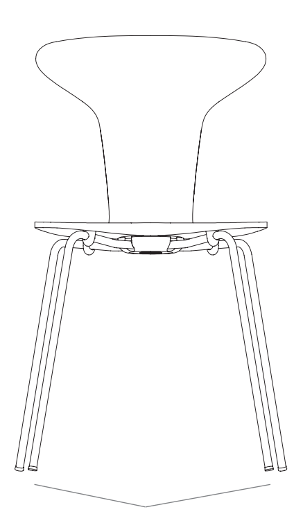
Glides for floor protection.

Options: Natural or stained wood veneers. Full upholstered