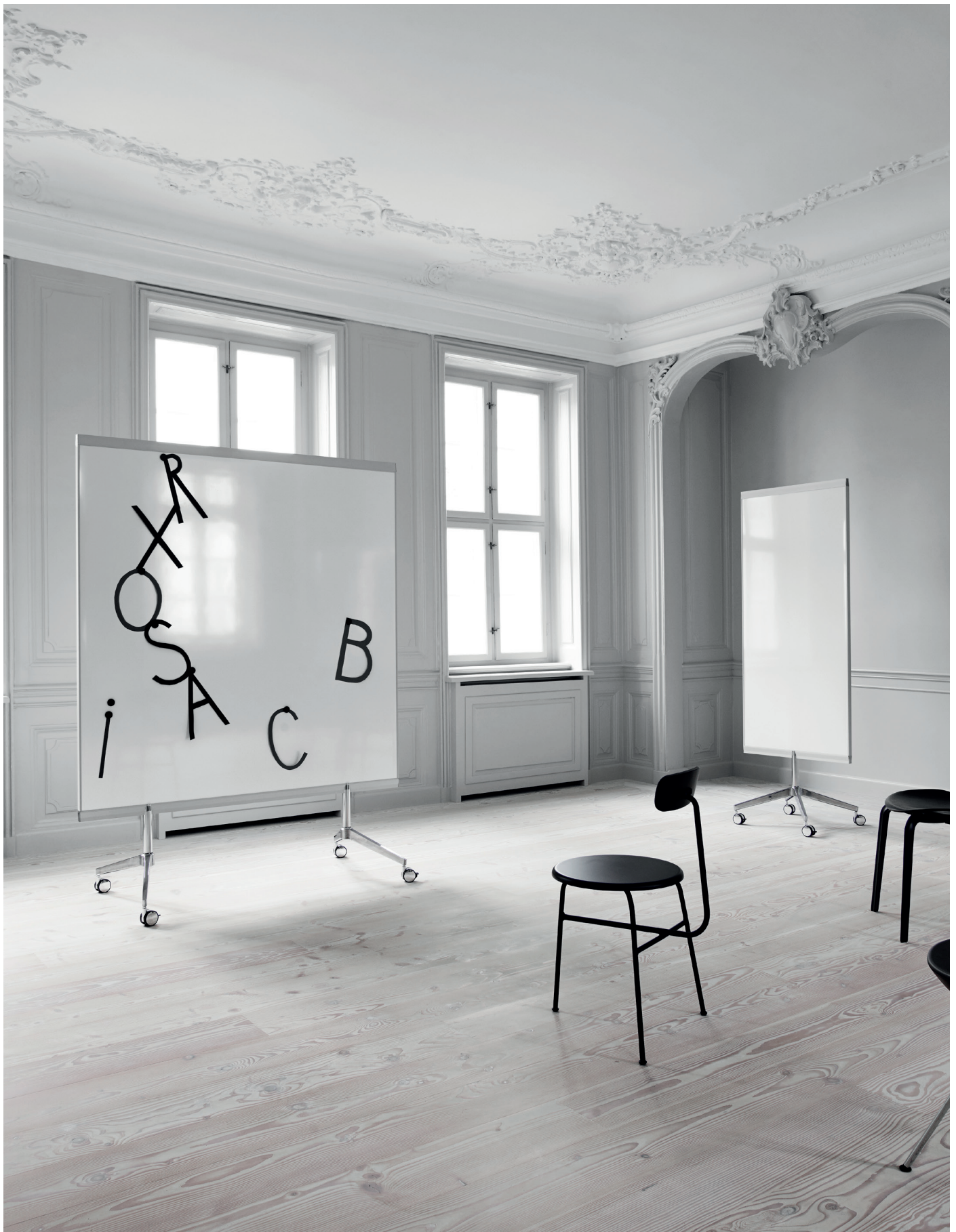
M3 mobile double-sided whiteboard

Magnetic writing surface e3 certified 99% recyclable 30-year warranty on writing surface