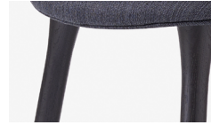
Black lacquered oak