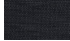
Balder 3 192 In stock