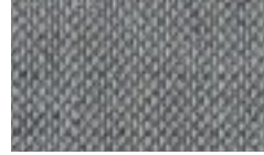
Sunniva 2 242 In stock