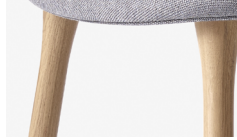
White oiled oak