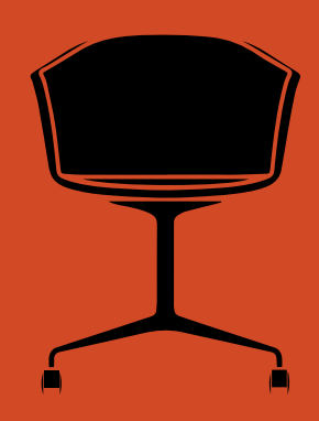
Elefy <sup>JH37</sup> Jaime Hayon 2020