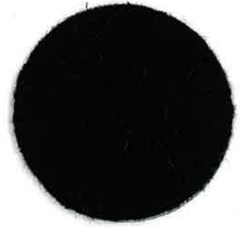
Preto | Black Pantone black ec