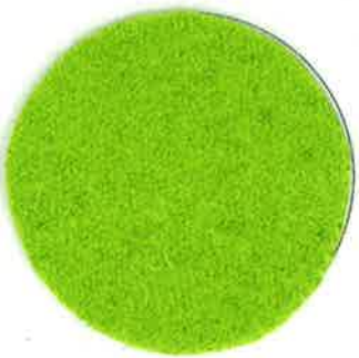
Verde Néon | Neon green Pantone 375