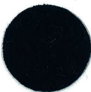
Azul escuro | Navy Pantone 7463C