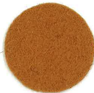
Laranja | Orange Pantone 1575ec