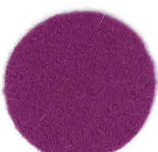
Púrpura claro | Light purple Pantone 681ec