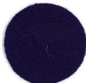
Violeta | Violet Pantone 2607ec