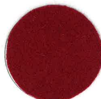
Magenta | Cerise Pantone 215ec