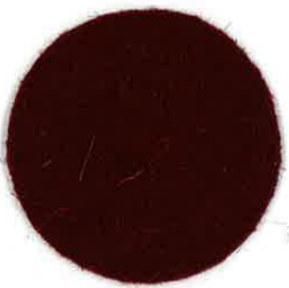
Bordeaux Pantone 209c