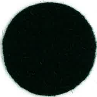
Verde escuro | Dark green Pantone 560C