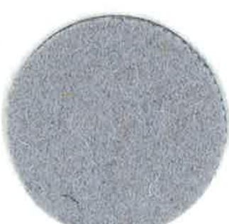
Gelo | Ice Pantone 420