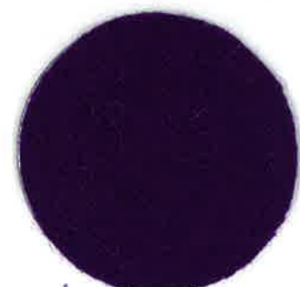
Beringela | Aubergine Pantone 260c