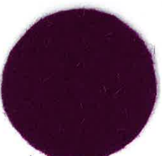
Púrpura | Purple Pantone 2622ec