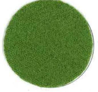
Verde clorofila | Chlorophyll green Pantone 7496C