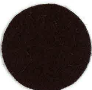
Beringela escuro | Dark aubergine Pantone 5115ec