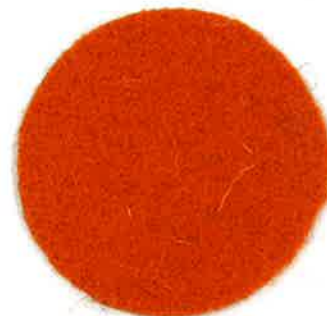
Laranja forte | Orange 21 Pantone orange 21