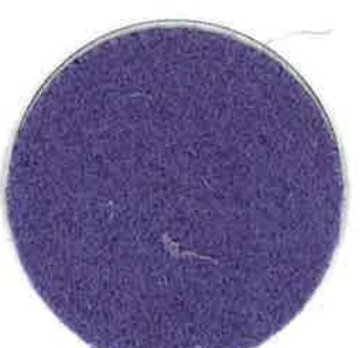
Lilás | Lilac Pantone 265ec