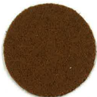
Camel Pantone 7505c