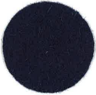
Azulado | Bluish Pantone 654C