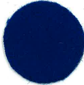
Azul cobalto | Cobalt blue Pantone 274C