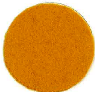
Amarelo torrado | Ark Yellow Pantone 7408c