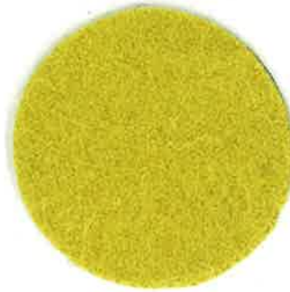
Verde ácido | Lime green Pantone 3975C