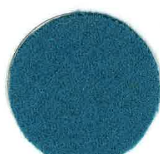
Azul céu | Lisbon sky blue Pantone 7454c