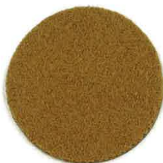
Mel | Honey Pantone 7504c