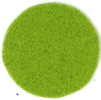
Verde claro | Light green Pantone 7495C