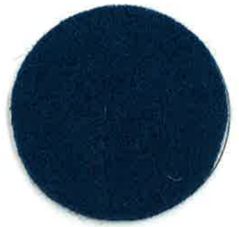
Azul médio | Middle blue Pantone 295ec