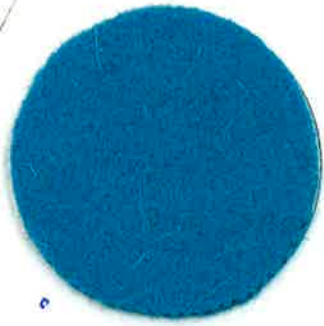
Azul turquesa | Turquoise Pantone 2935C