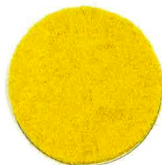
Amarelo Canário | Canary Yellow Pantone 3495