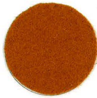
Abóbora | Pumpkin Pantone 7413c