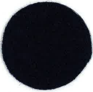
Roxo escuro | Dark purple Pantone 533C