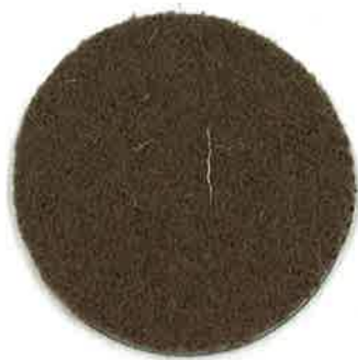
Pinhão | Warm grey Pantone 10c