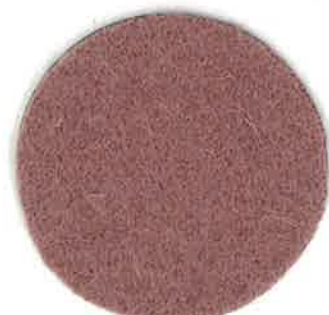
Rosa velho | Dusk pink Pantone 5005c