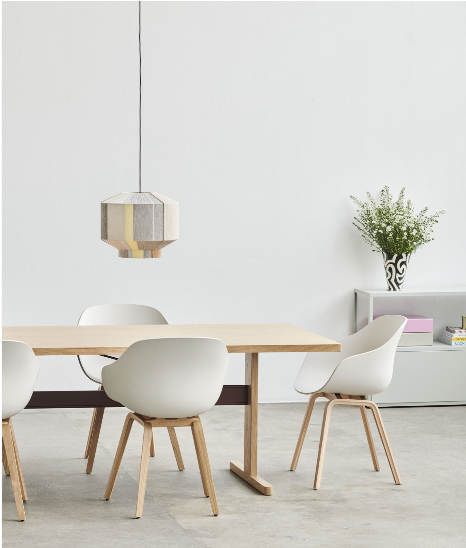
AAC 222 | White shell | Water-based lacquered oak base