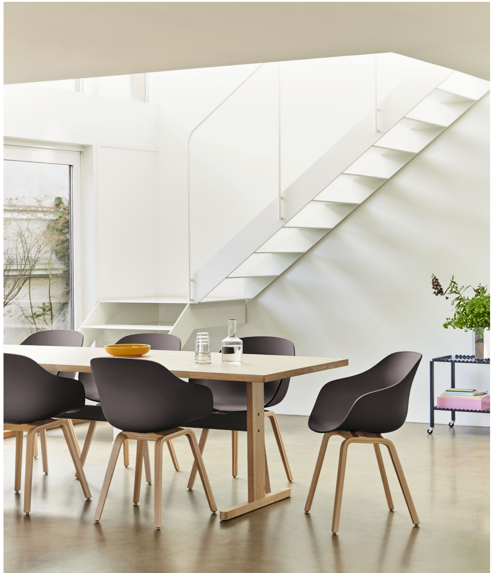
AAC 222 | Raisin shell | Water-based lacquered oak base