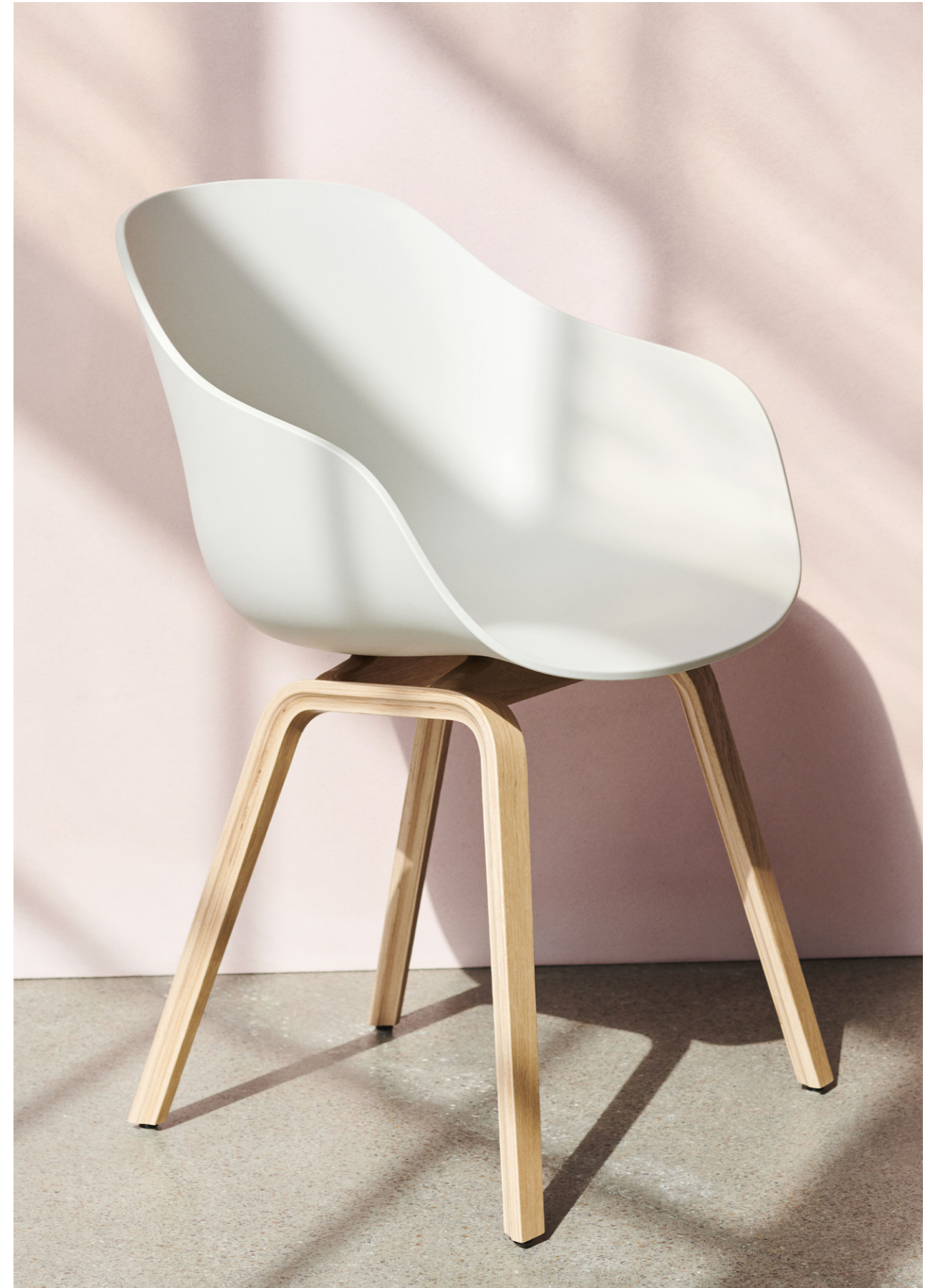
AAC 222 | White shell | Water-based lacquered oak base