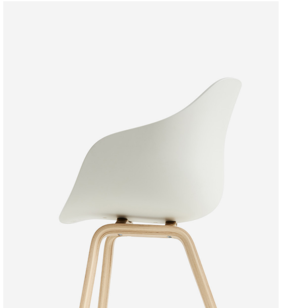
AAC 222 | White shell | Water-based lacquered oak base