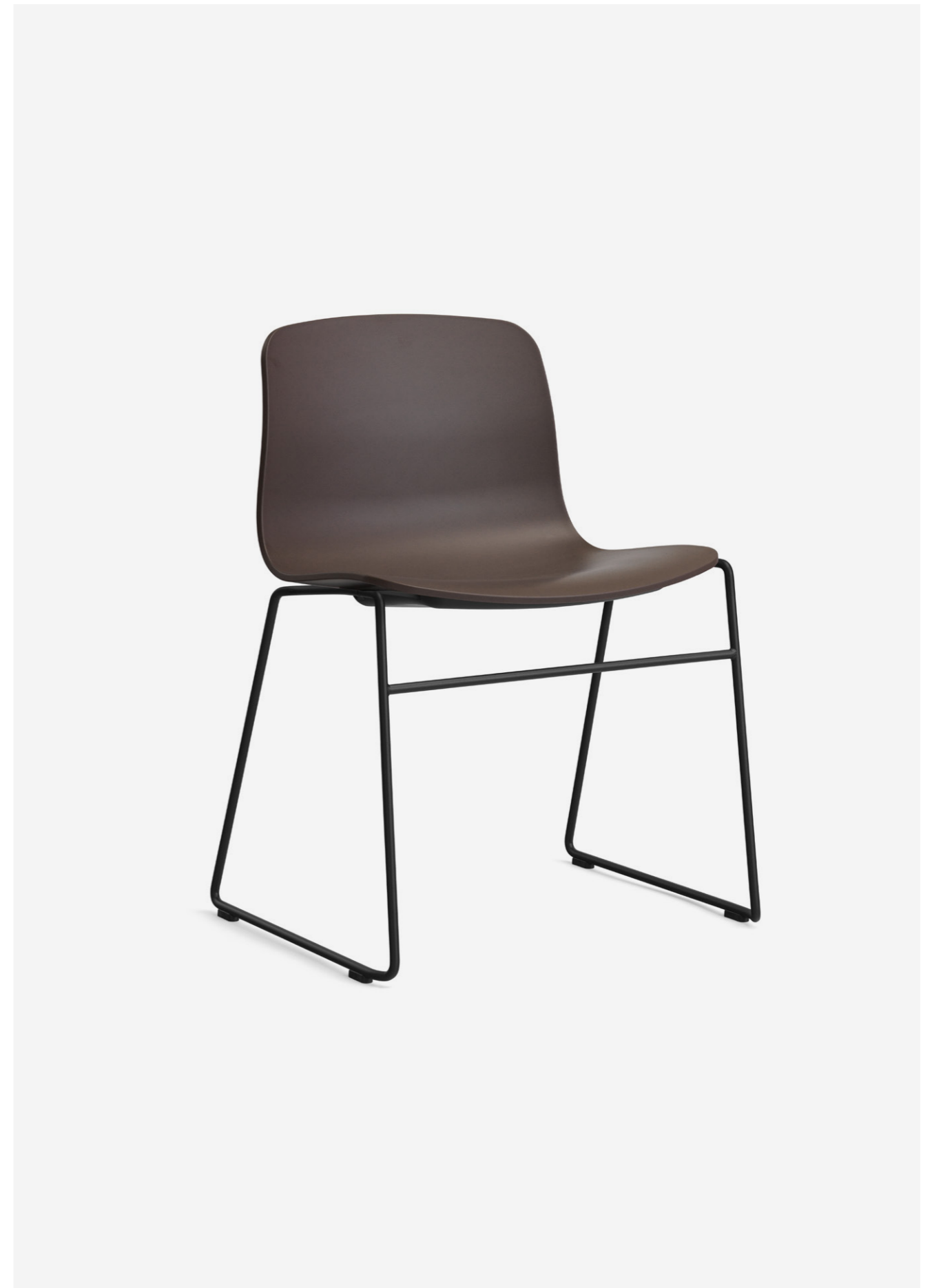
AAC 08 | Raisin 2.0 shell | Black powder coated steel base