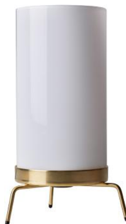
OPAL GLASS WITH UNTREATED SOLID BRASS BASE