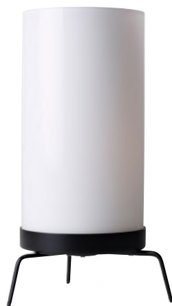
OPAL GLASS WITH BLACK LACQUERED STEEL BASE