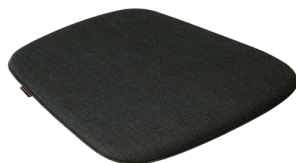
DARK BROWN FABRIC: REMIX 393