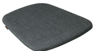
DARK BLUE/GREY FABRIC: REMIX 173

The wooden chair is available with a seat cushion in either fabric or leather. The seat cushion can be mounted on the chair or delivered separately.