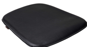
BLACK LEATHER: KANSAS