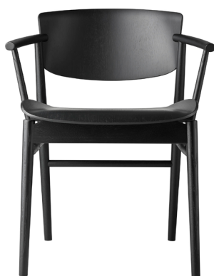
BLACK COLOURED OAK