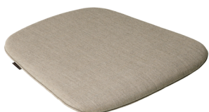
BEIGE FABRIC: REMIX 233