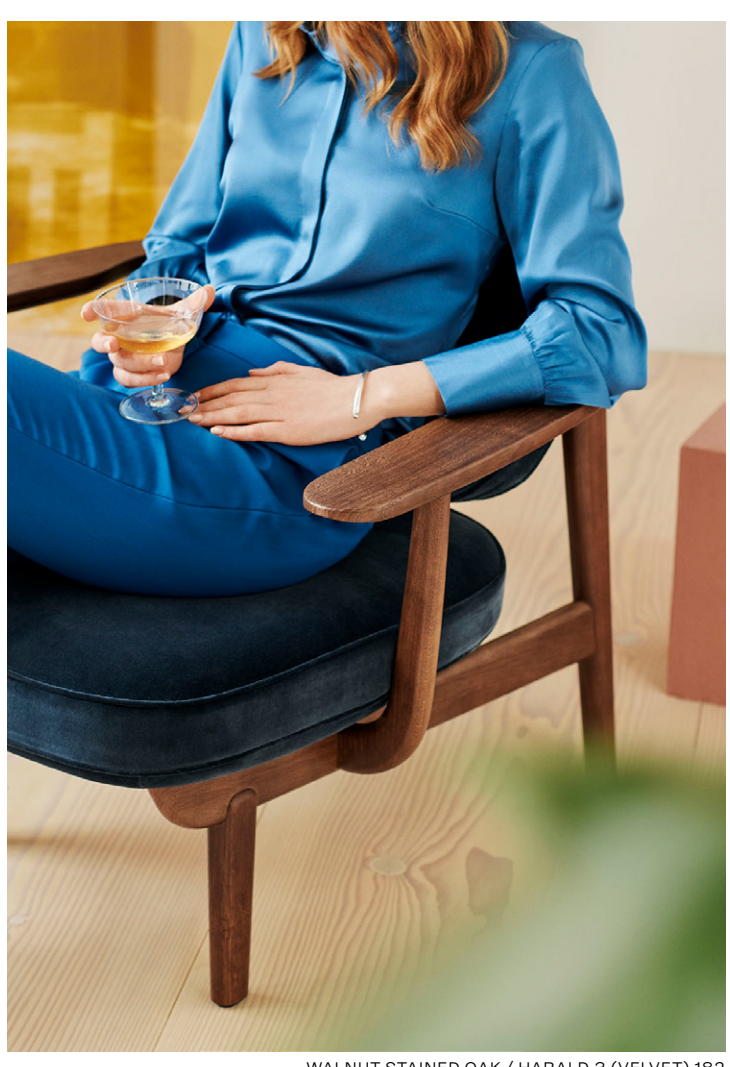
WALNUT STAINED OAK / HARALD 3 (VELVET) 182

Fred™ works in home, office and hospitality settings.